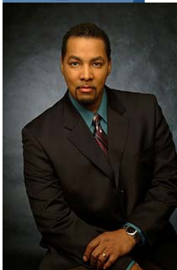
PROMISE LAND CHURCH OUTREACH