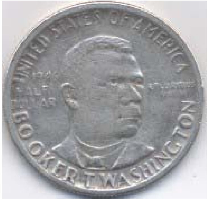
Booker T. Washington half dollar

Few things help an individual more than to place responsibility upon him and to let him know that you trust him. Booker T. Washington