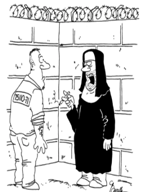
"Identity theft. What are you in for?"